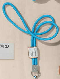
BMW i LANYARD