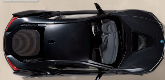
BMW i BMW i8 1:18, 1:43, 1:64