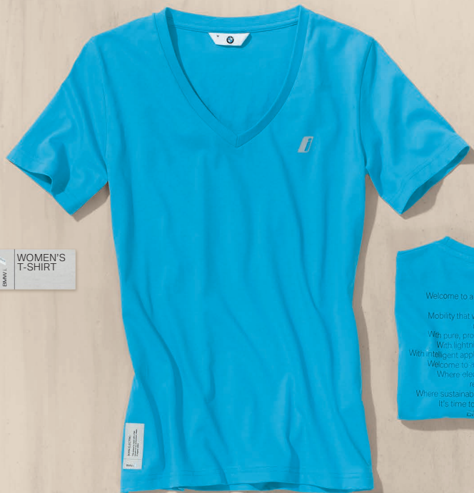
BMW i WOMEN'S T-SHIRT